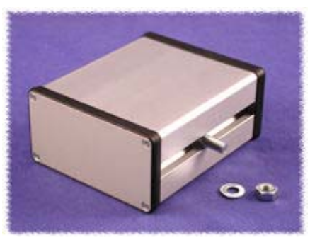
(click to enlarge)