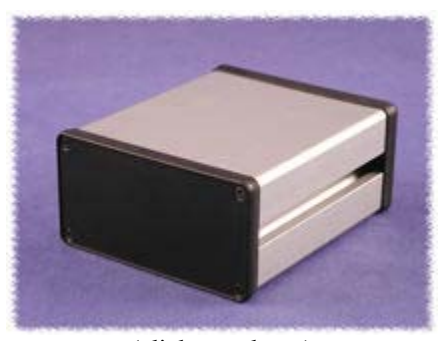
(click to enlarge)

Link here to photo tables of each part number